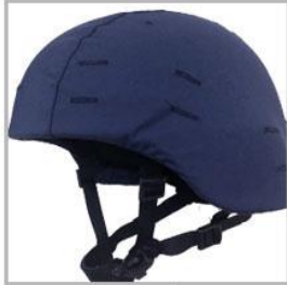
Standard and tactical helmet covers