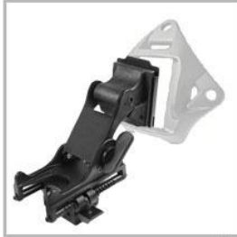
Night vision mount and accessories