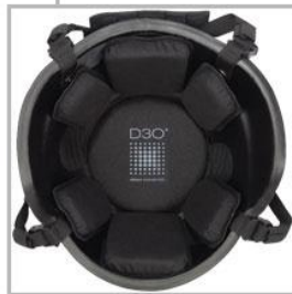
Pad system upgrades